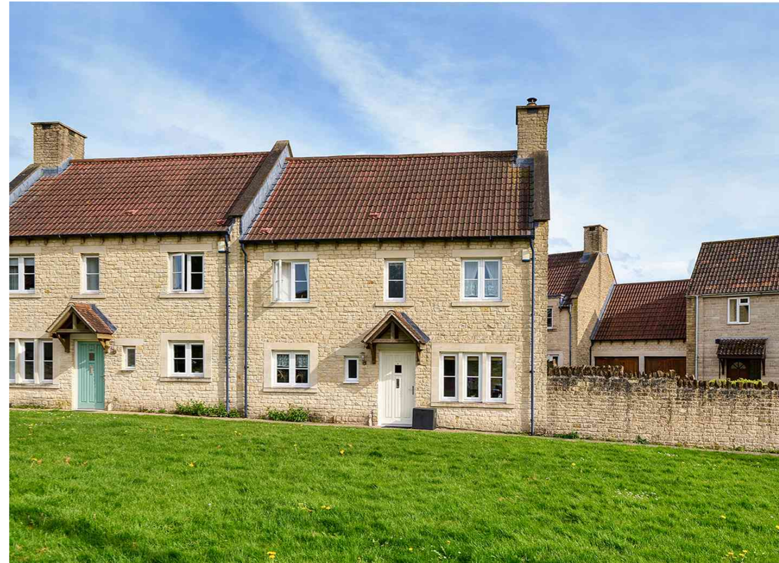
Doynton, Nr Bath