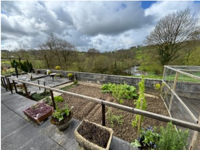
GARDEN (THIRD IMAGE)