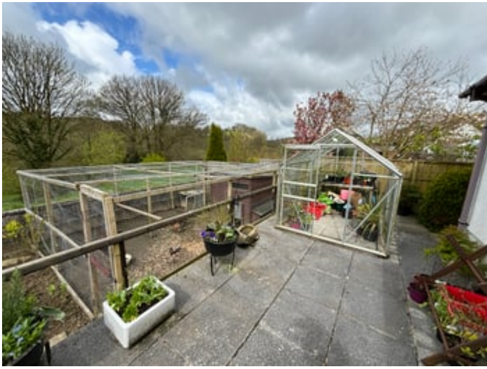
GARDEN (SECOND IMAGE)