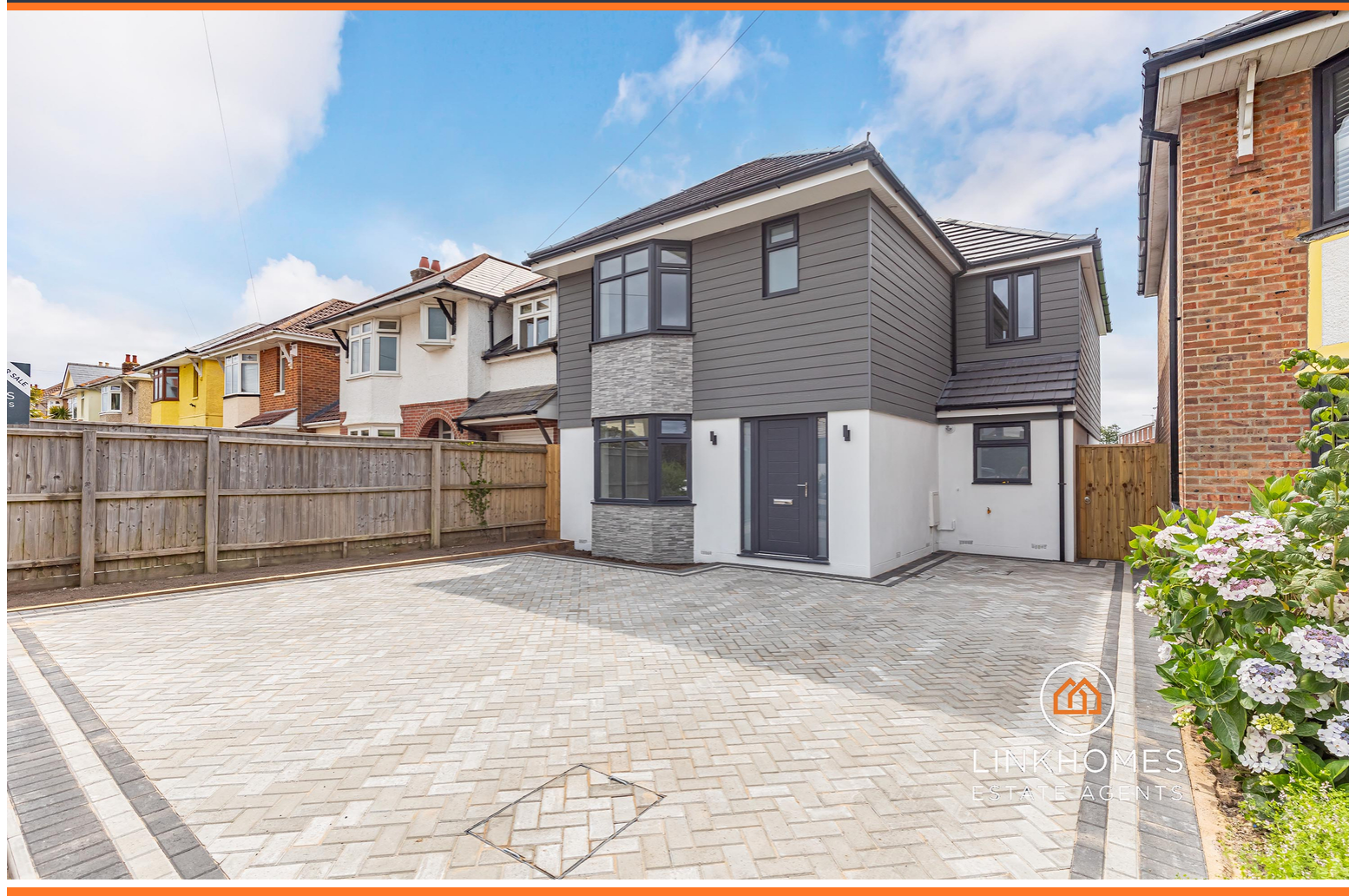
8 Hennings Park Road, Poole, Dorset, BH15 3QU Guide Price £635,000

** SIMPLY STUNNING ** RECENTLY EXTENDED AND RENOVATED TO A HIGH SPECFICATION ** NO FORWARD CHAIN ** Link Homes Estate Agents are delighted to present for sale this recently refurbished and extended four bedroom, three bathroom detached family home situated in the heart of Oakdale. Benefitting from an array of standout features including a four double bedrooms with bedroom one offering a stylish four-piece en-suite, a open plan shaker-style kitchen/dining room with Quartz tops and bi-fold doors leading onto the South-facing private garden, a separate snug lounge with feature bay windows, a separate utility room, a downstairs three-piece shower room, a pantry, ample storage and a block-paved driveway for multiple vehicles. A must view to fully appreciate the accommodation on offer!