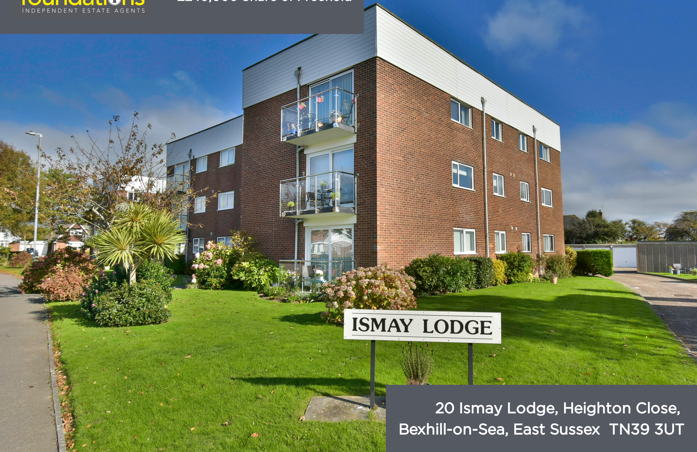
20 Ismay Lodge, Heighton Close, Bexhill-on-Sea, East Sussex TN39 3UT