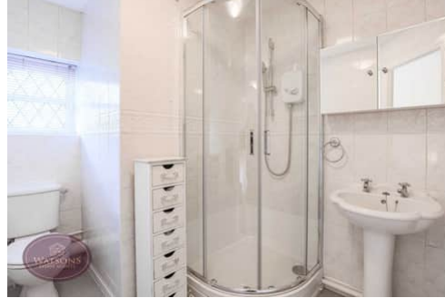
Detached Family Home