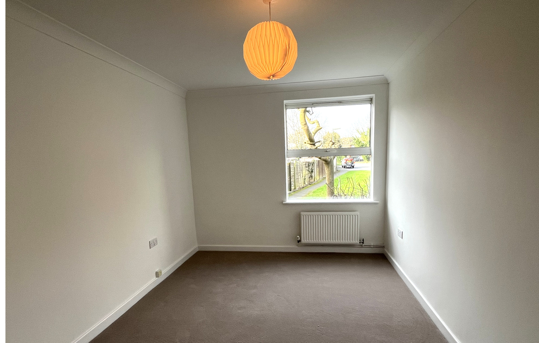
Vanguard House, Douglas Road, Stanwell, Surrey TW19 7JW £185,000 - Leasehold