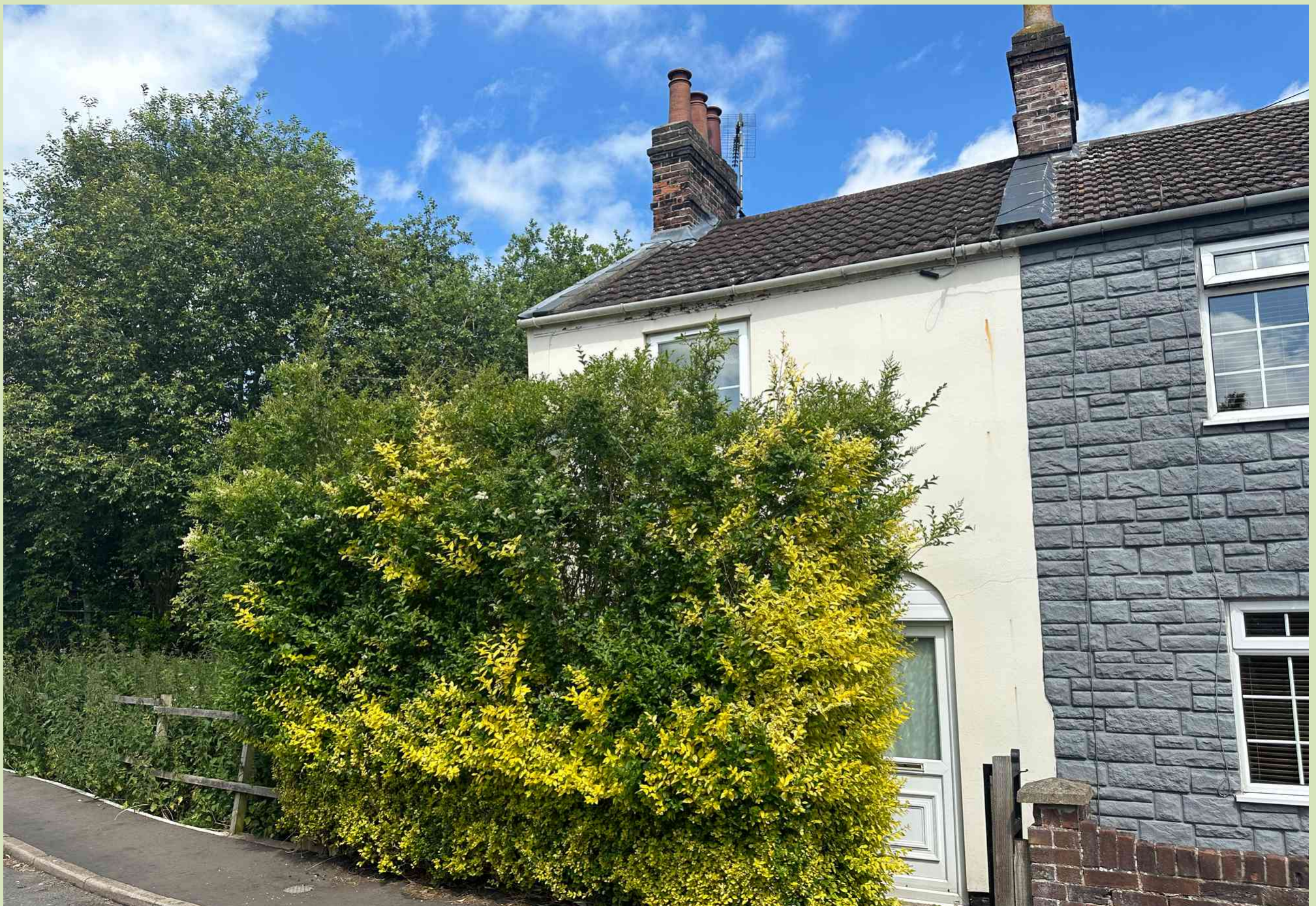
1 Extons Place, King's Lynn Guide Price £155,000