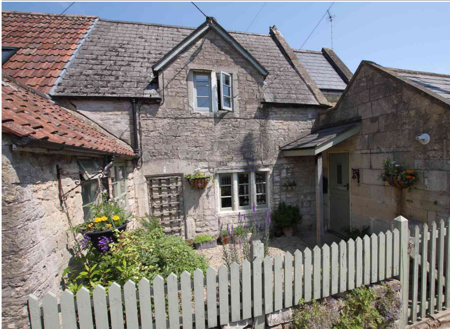
Church Cottages, Winsley