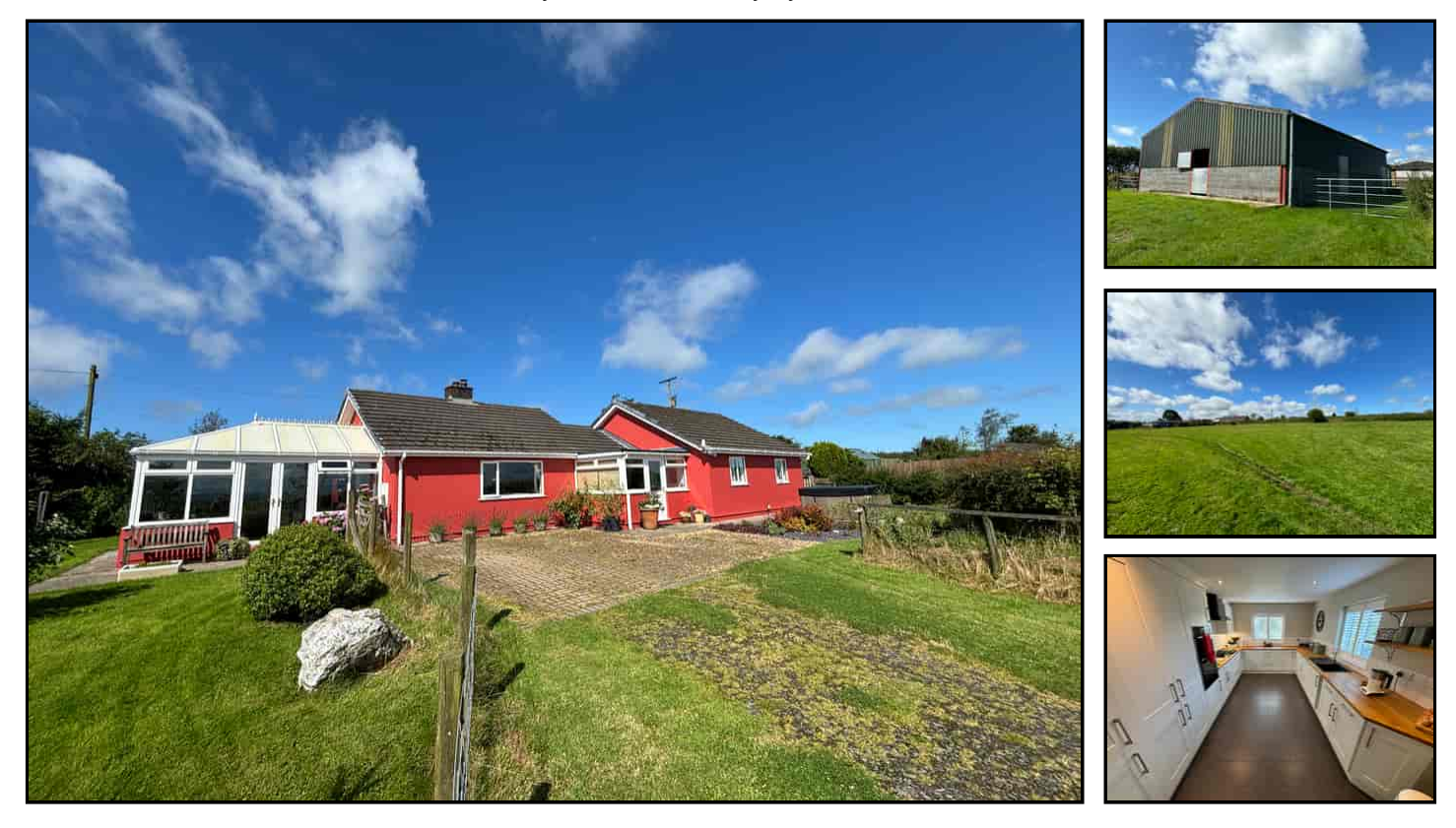
Breath taking location. A delightful country smallholding set in approximately 15.2 acres. Cwrtnewydd, near Llanybydder, West Wales

Estate Agents | Property Advisers Local knowledge, National coverage