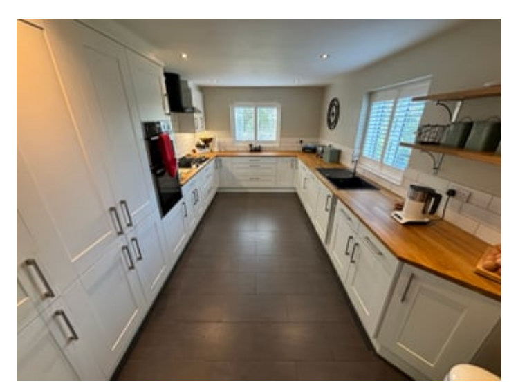
KITCHEN (SECOND IMAGE)

16' 0" x 10' 11" (4.88m x 3.33m). A stylish Shaker style fitted kitchen with a range of wall and floor units with hardwood work surfaces over, single sink and drainer unit, eye level double oven, integrated fridge and dishwasher, 5 ring LPG hob with extractor hood over, spot lighting, ceramic slate effect flooring, upright radiator and doubler aspect windows.