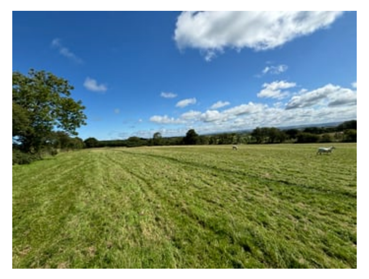
THE LAND (FOURTH IMAGE)