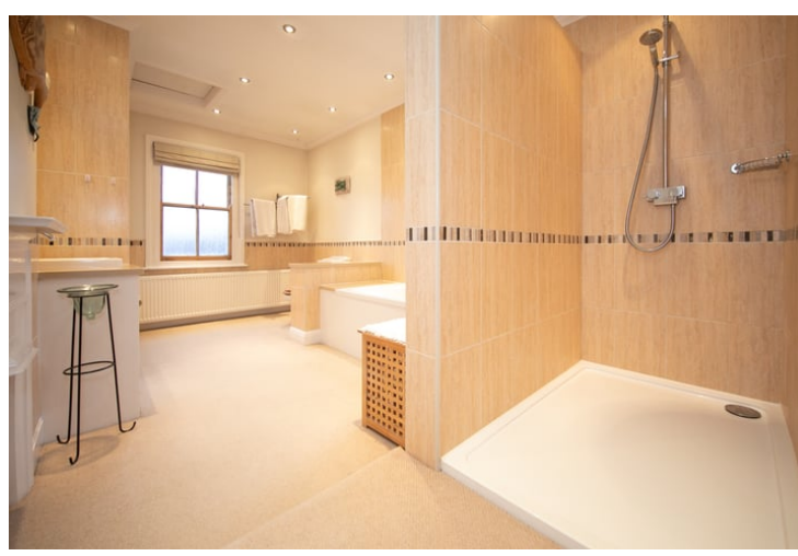
15' 11" x 8' 08" (4.85m x 2.64m) Double glazed obscured window to side and rear, radiators, inset spot lights, loft access, panelled bath, walk in shower, low level WC, wash hand basin.