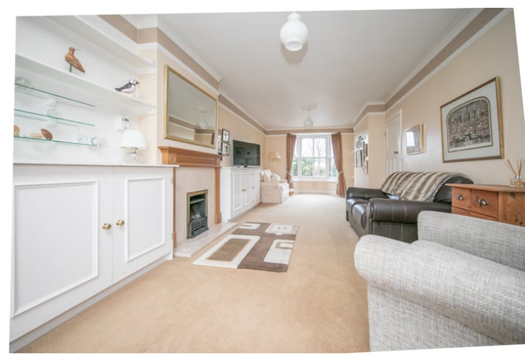
27^{\circ} 5" x 11' 02" (8.36m x 3.40m) Narrowing to 10'01 Bay fronted double glazed window to front, French doors to rear, picture rail, fitted alcove unit, fireplace.