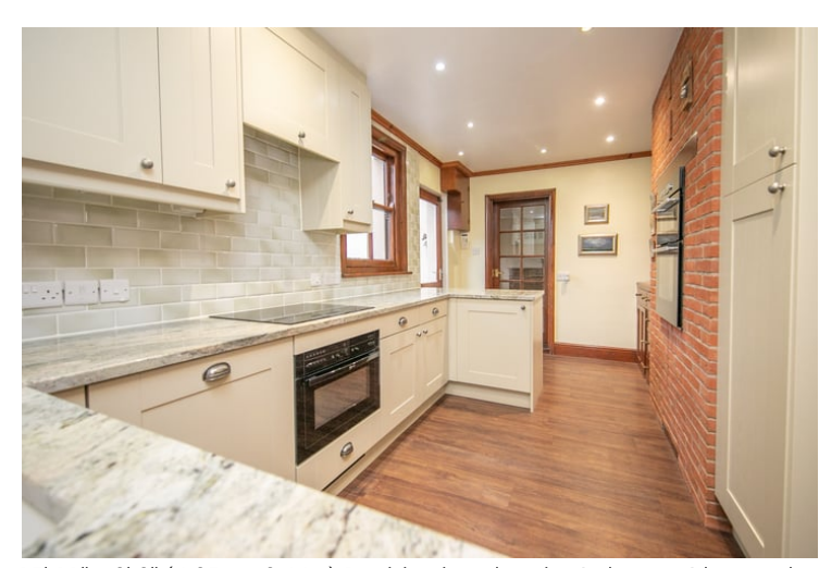
15' 11" x 8' 8" (4.85m x 2.64m) Double glazed sash window to side, wooden side door inset spot lights. Fitted shaker style kitchen with a range of wall and base units, inset one and half bowl sink, granite worktops, induction hob, under counter oven, wall mounted double oven.