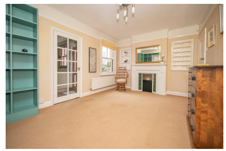
13' 4" \times 10' 6" (4.06m x 3.20m) Bay fronted double glazed window to front, picture rail, fitted alcove unit, fireplace, panelling.