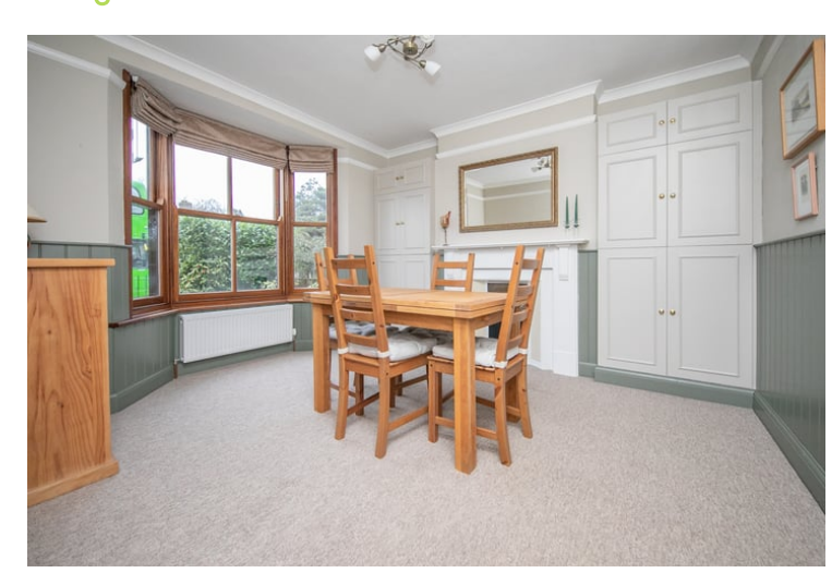
14' 8" \times 10' 7" (4.47m \times 3.23m) Double glazed sash window to rear, radiator, wooden mantle, French doors leading to side extension, under stairs storage.