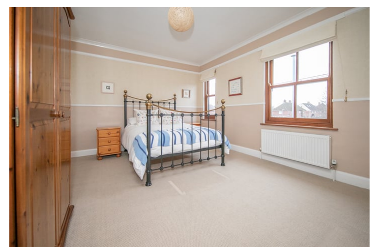
14' 7" x 11' 8" (4.45m x 3.56m) Double glazed window to front, radiator.