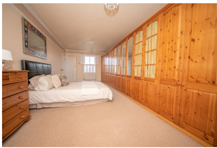
25' 9'' \times 9' 1'' (7.85m \times 2.77m) Double glazed windows to front and rear with shutters, two radiators, fitted wardrobes.