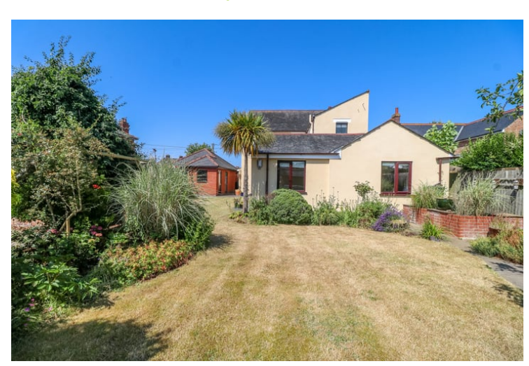
A beautifully well maintained rear enclosed garden, mainly laid to lawn, block paved patio, raised planters, fish pond, storage shed and workshop. Well stocked with mature shrubs and trees. Side access to the front.