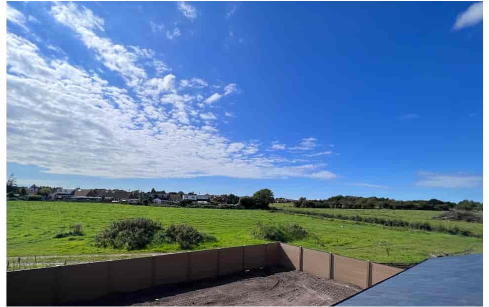
The Martingales, Farriers Fold, Gill Lane, Walmer Bridge, Preston, Lancashire PR4 5DR £850,000 - Freehold