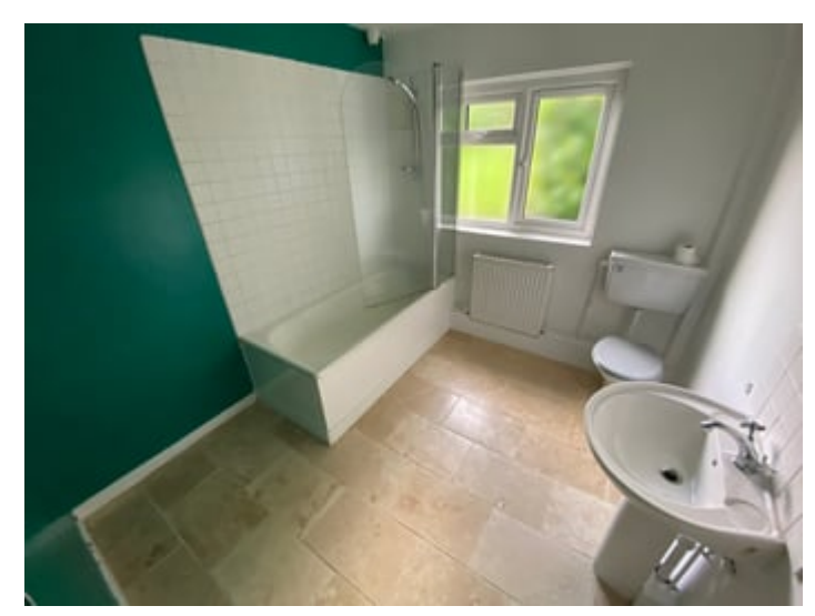
Having a 3 piece suite comprising of panelled bath with shower over, low level flush w.c., pedestal wash hand basin, radiator, extractor fan.