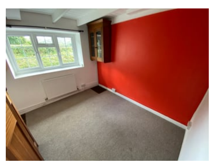
10' 0" x 9' 7" (3.05m x 2.92m). With radiator, fitted wardrobes and glazed cabinets.