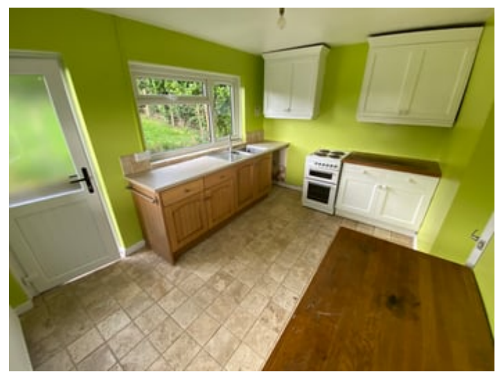
12' 9" x 8' 8" (3.89m x 2.64m). A cottage style fitted Kitchen with a range of wall and floor units with work surfaces over, stainless steel sink and drainer unit, electric cooker point and space, plumbing and space for automatic washing machine, rear entrance door radiator, double aspect windows, tiled flooring.