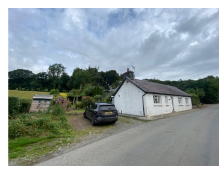
Off street parking area for 2/3 vehicles.