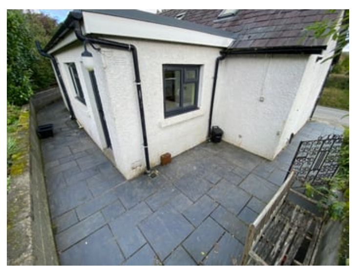
A patio area lies to the side of the property.