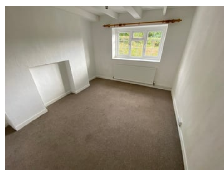
13' 5" x 10' 5" (4.09m x 3.17m). With radiator, original beamed ceiling.