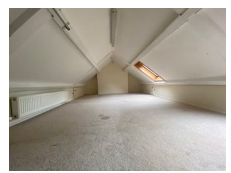
19' 4" x 13' 1" (5.89m x 3.99m). With radiator, two Velux roof windows, undereaves storage area, original beamed ceiling.