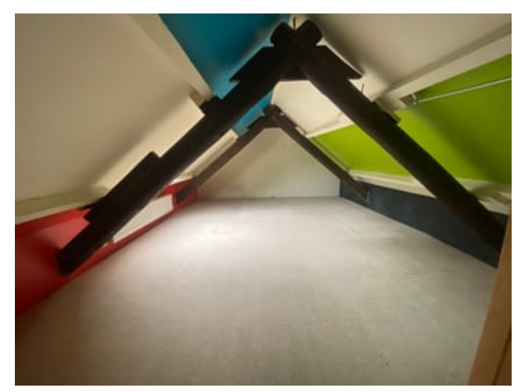
18' 7" x 13' 1" (5.66m x 3.99m). With original 'A' framed beams, radiator, Velux roof window.