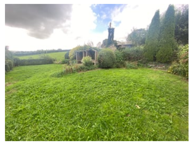
The property enjoys delightful cottage style gardens laid mostly to lawn with various shrub and flower borders and overlooks open farmland.