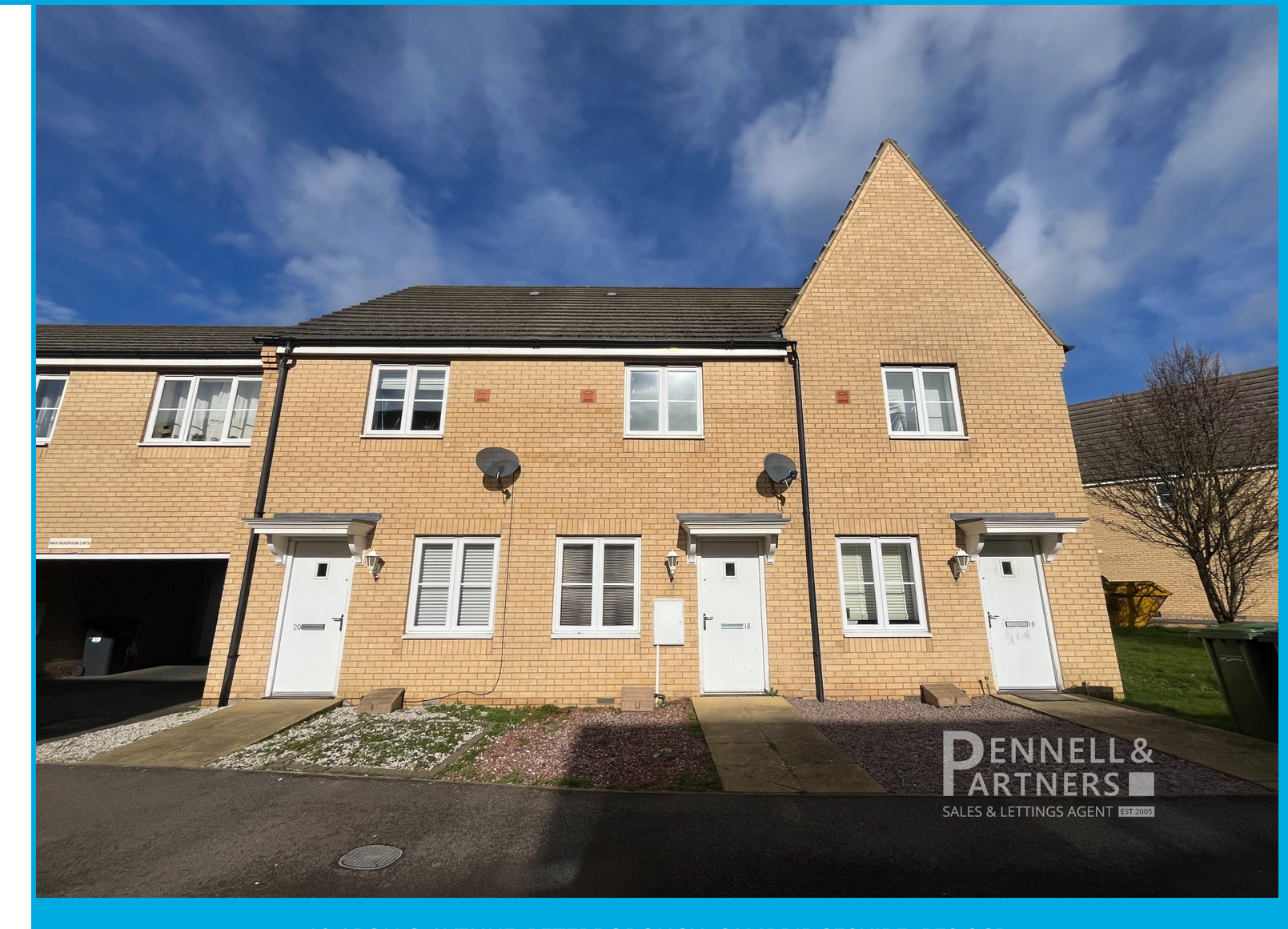
18 APOLLO AVENUE, PETERBOROUGH, CAMBRIDGESHIRE. PE2 8GB