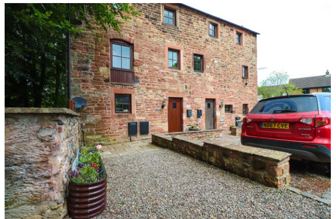
FRONT OF THE PROPERTY