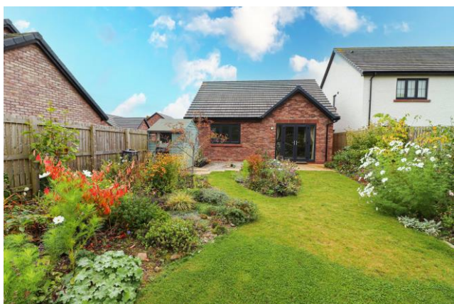
REAR OF THE PROPERTY

TENURE We are informed the tenure is Freehold.