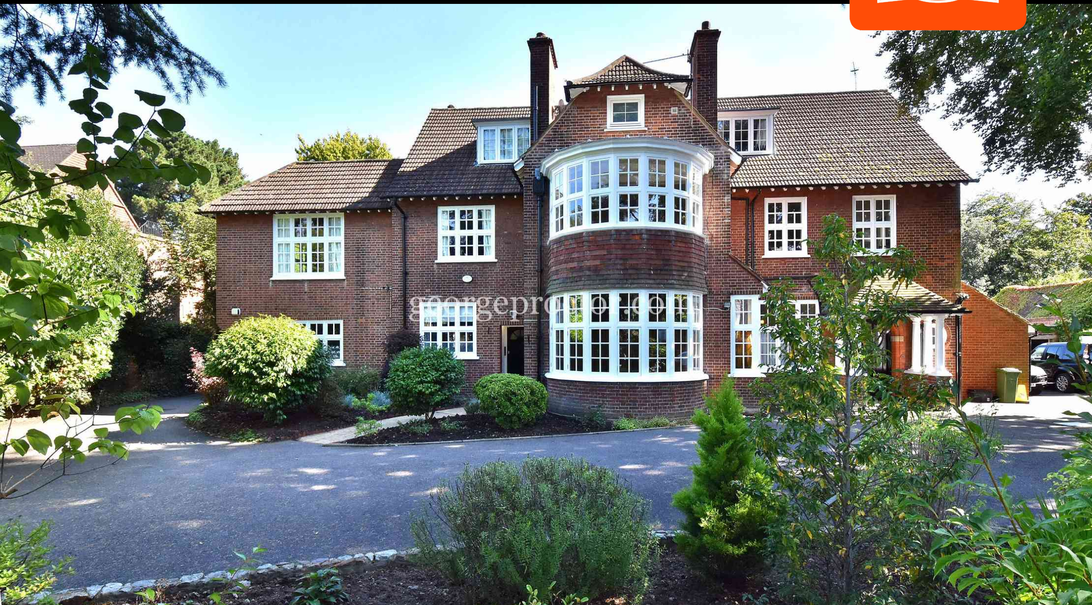
Pines Road, Bromley, Kent. BR1 2AA