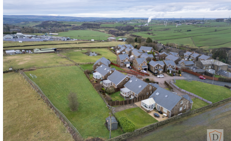
5 Monarch Gate, Denholme, Bradford, West Yorkshire, BD13 4EJ