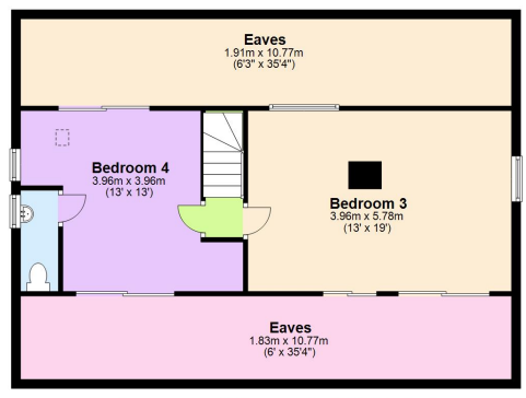
Total area: approx. 229.5 sq. metres (2470.0 sq. feet) This plan is for illustrative purposes only