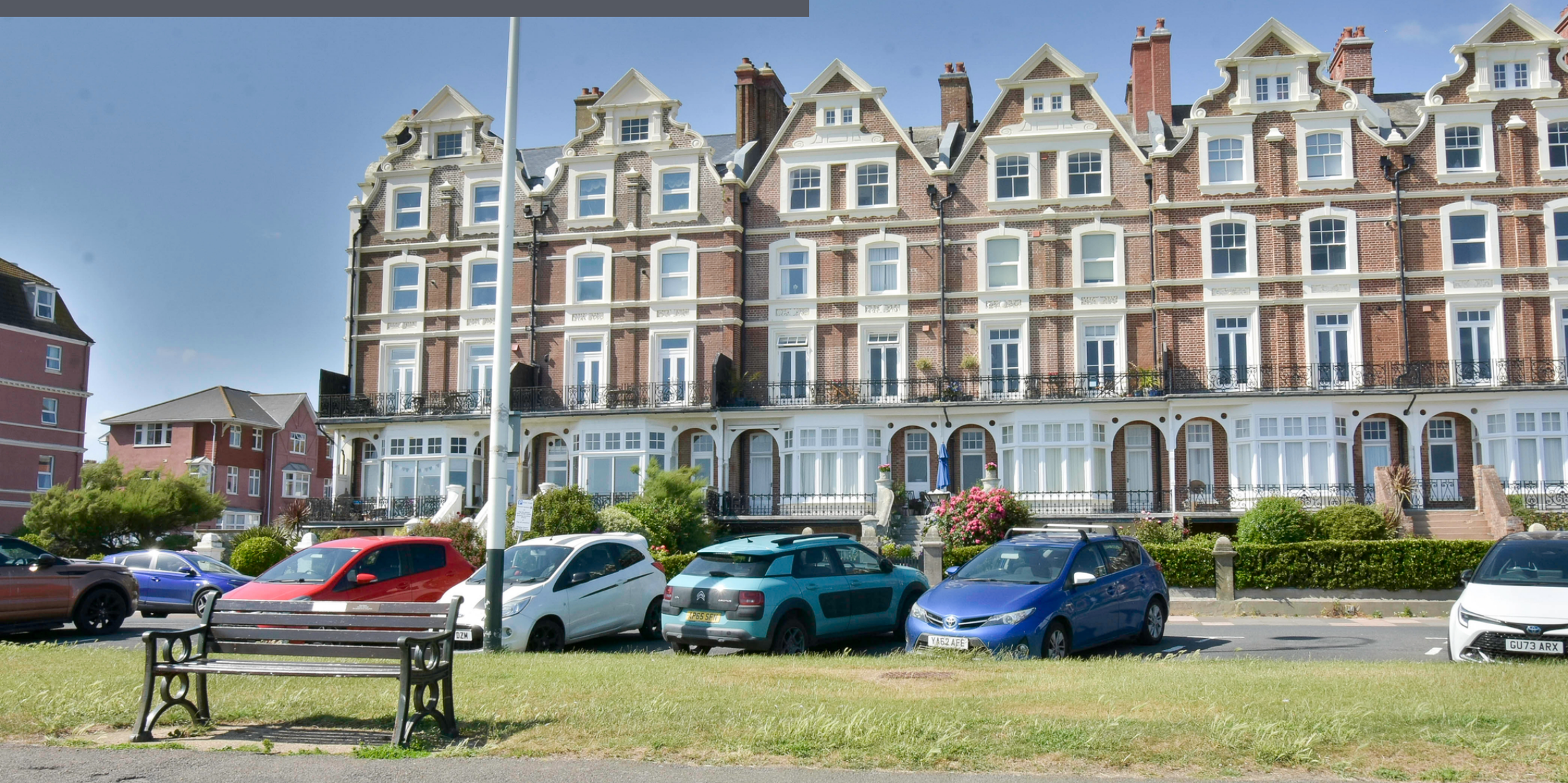
19 Carlton Court, Knole Road, Bexhill- on-Sea, East Sussex TN40 1LG