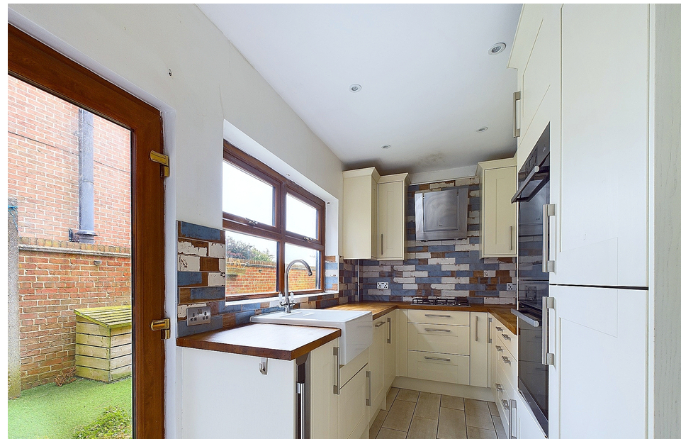
Church Street, Heage, Belper, Derbyshire DE56 2BG £169,950 - Freehold