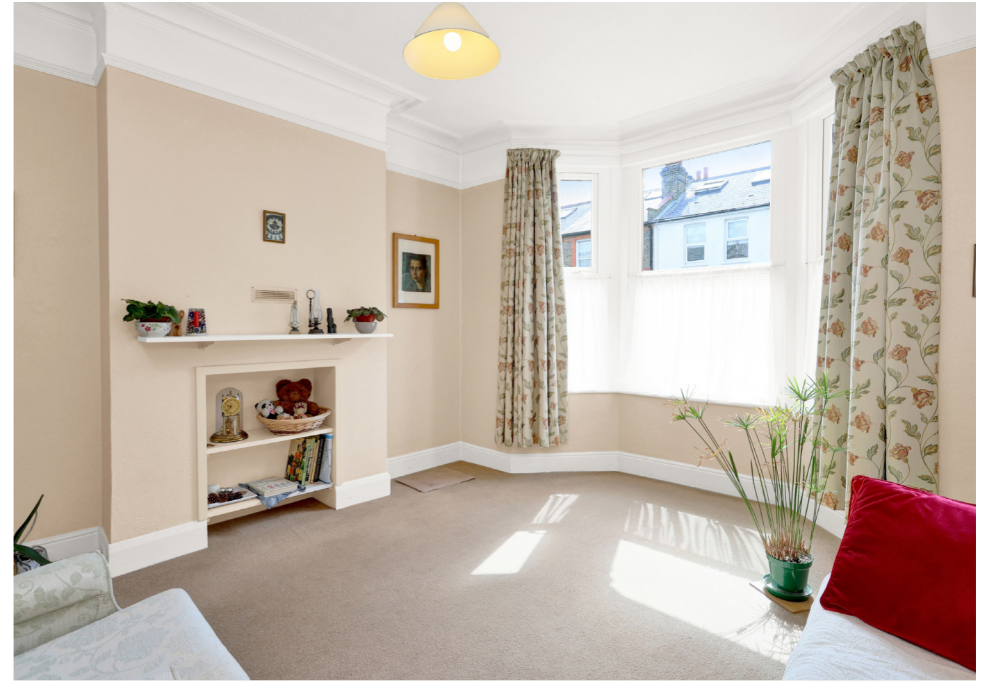
2 BEDROOM HOUSE