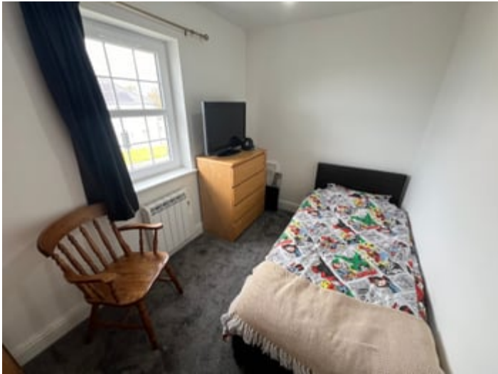
7' 0" x 10' 9" (2.13m x 3.28m) with double glazed window to front with sea views, electric radiator.