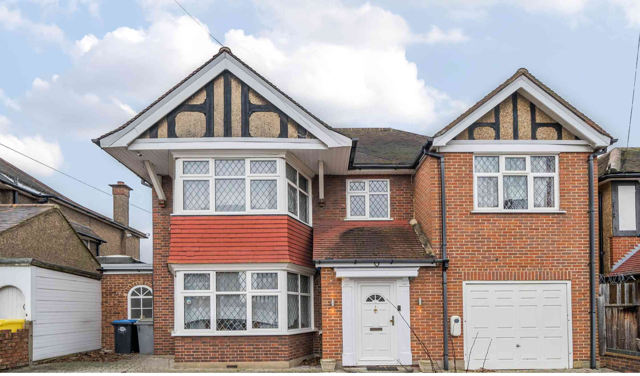
Shaftesbury Avenue, Harrow, HA3 0QU