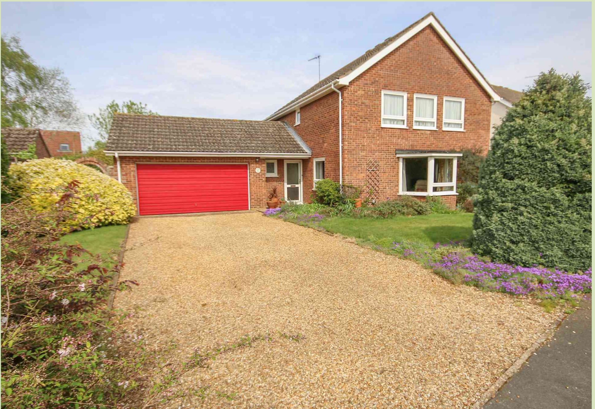
10 The Boltons, South Wootton Guide Price £445,000