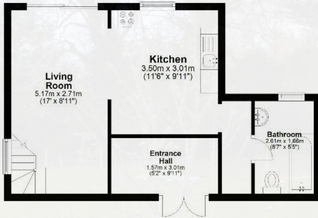
Ground Floor Approx. 37.1 sq. metres (399.5 sq. feet)