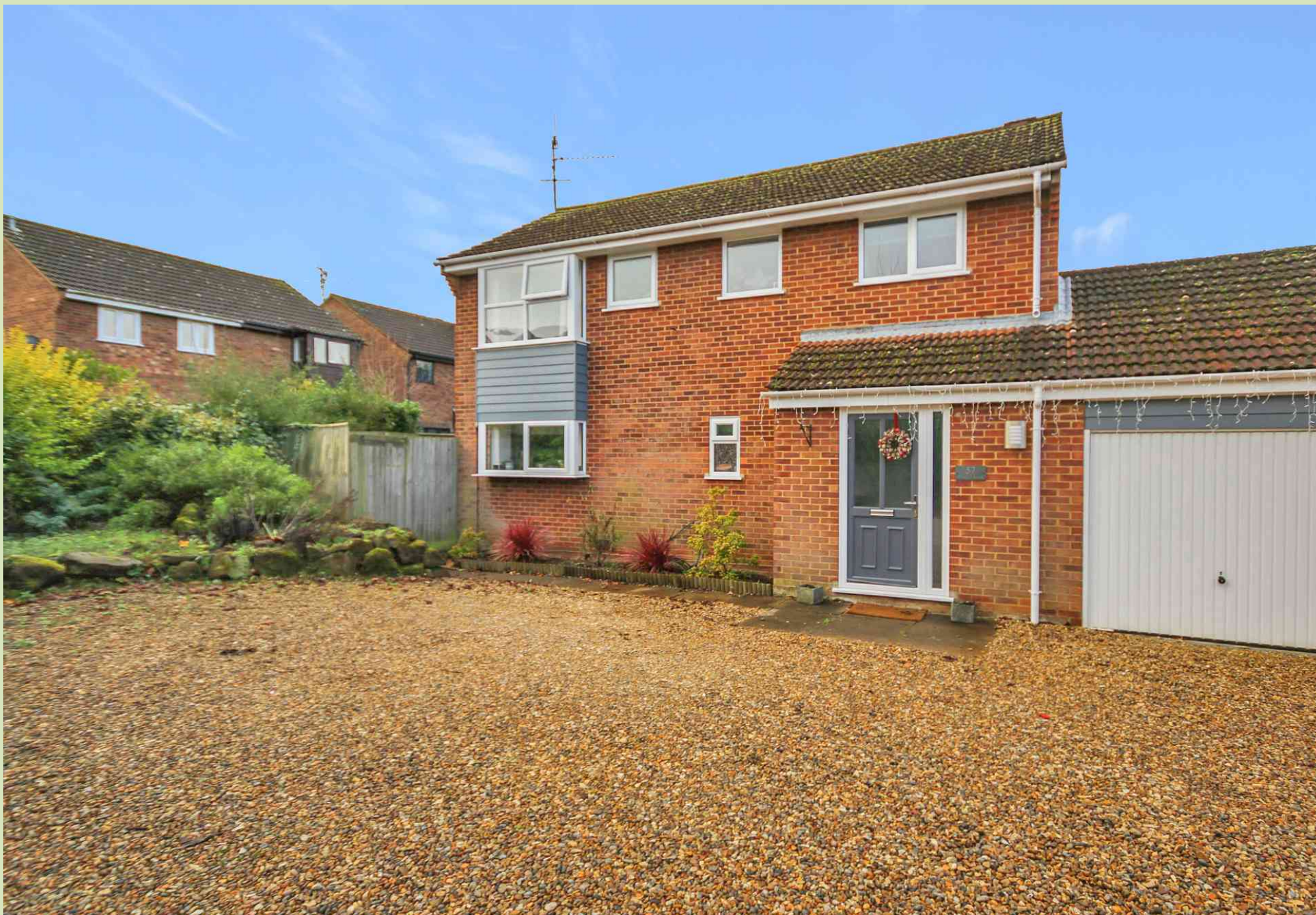
57 Pingles Road, North Wootton Guide Price £349,950