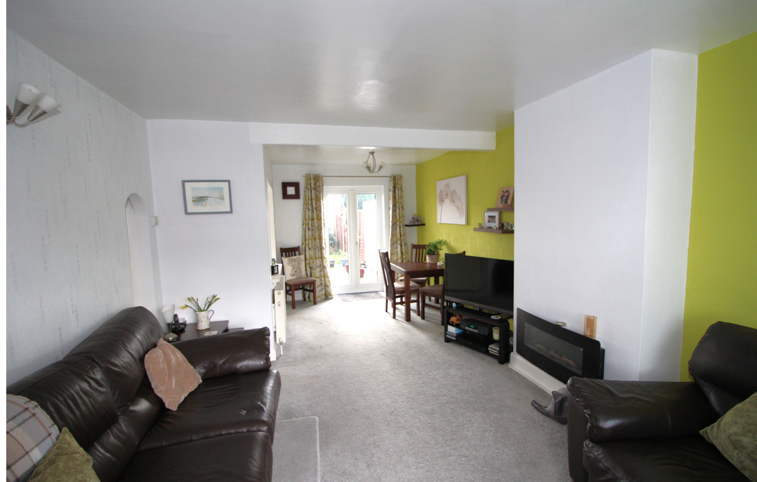
26 Desford Way, Ashford, Surrey TW15 3AT £429,950 - Freehold