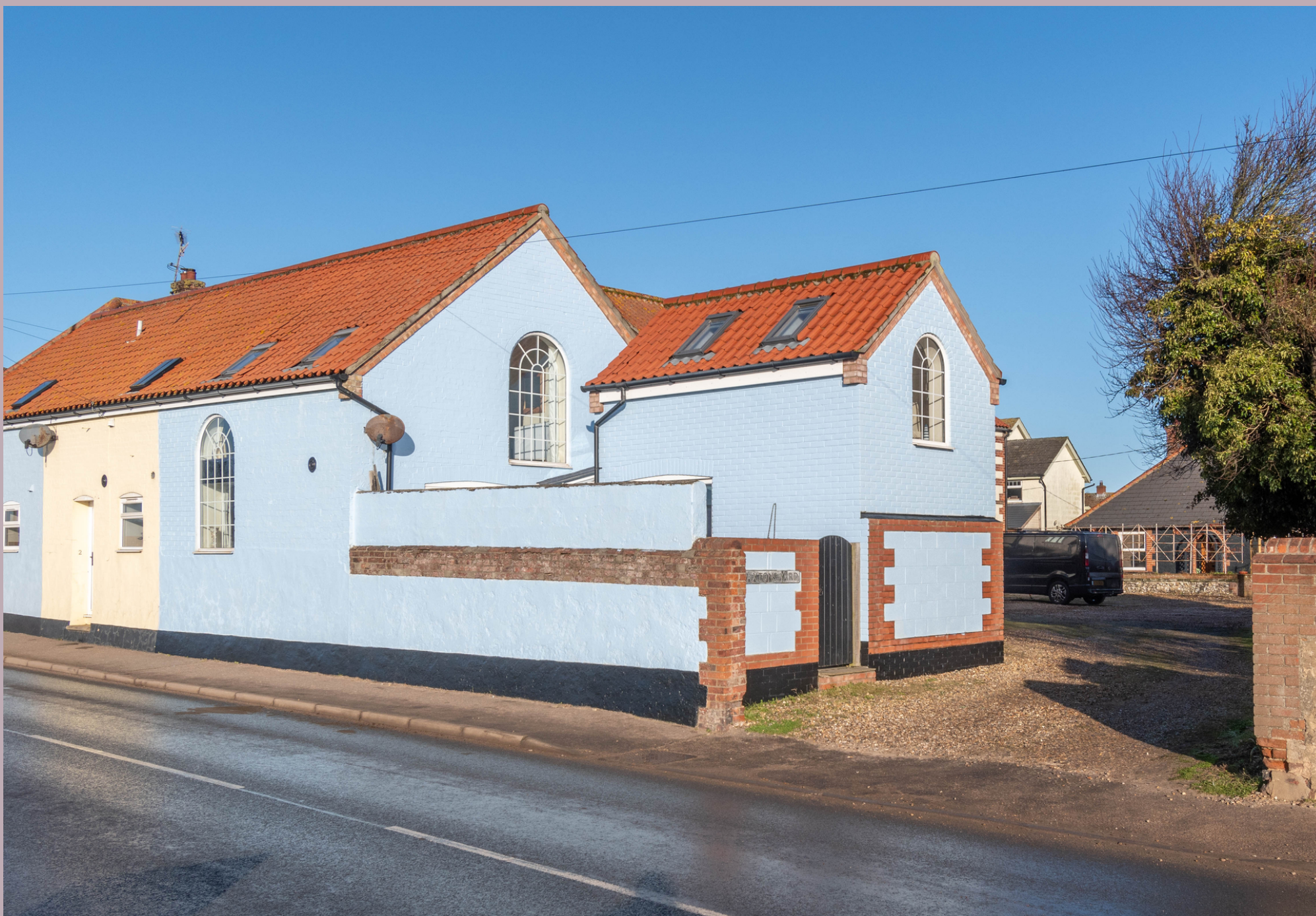
1 Claxtons Yard, Wells-next-the-Sea £1,200 per calendar month