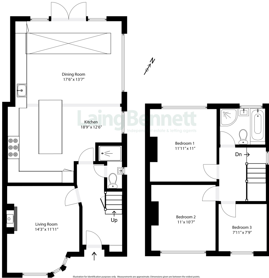
Illustration for identification purposes only. Measurements are approximate. Dimensions given are between the widest points. Not to scale. Outbuildings are not shown in actual location.

Approximate Gross Internal Area (Including Low Ceiling) = 108 sq m / 1167 sq ft