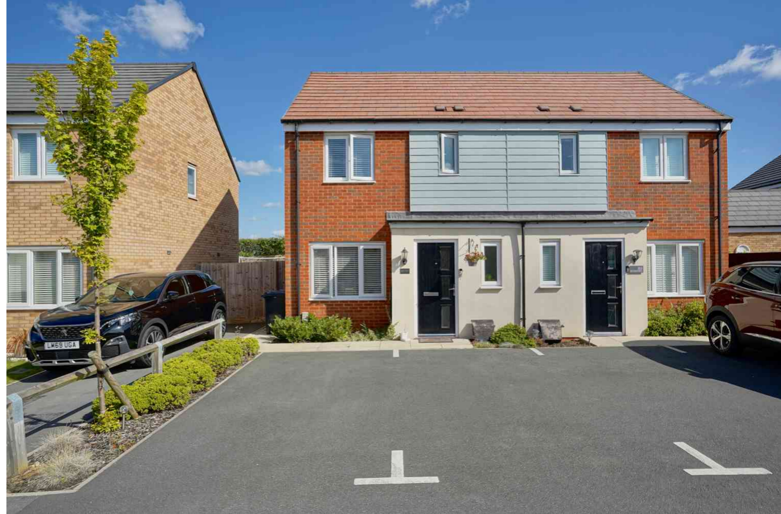
Bloomfield Drive, Huntingdon PE29 6LD