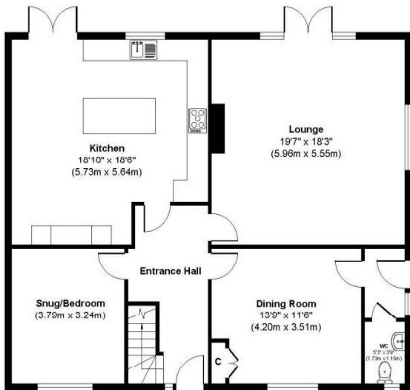
Ground Floor Approximate Floor Area 1169 sq. ft (108.61 sq. m)