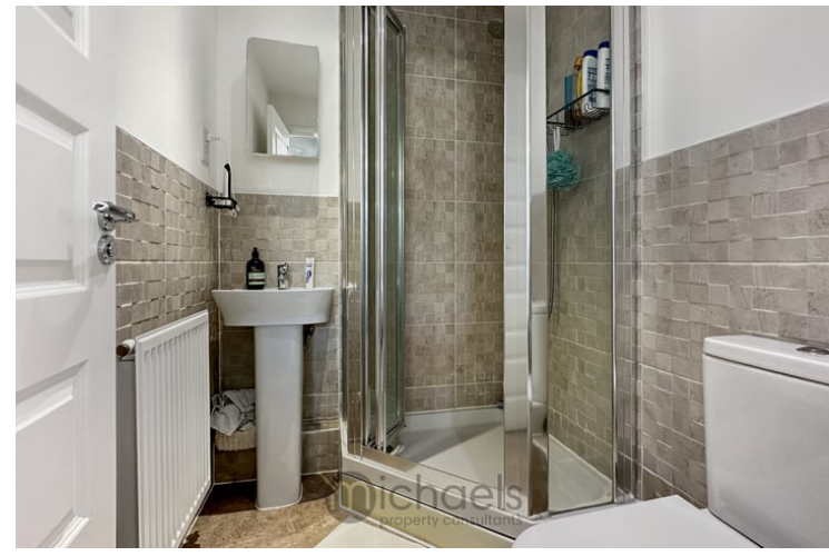
Low level WC, wash hand basin, fully tiled shower cubical, radiator, part tiled walls, spot lights.