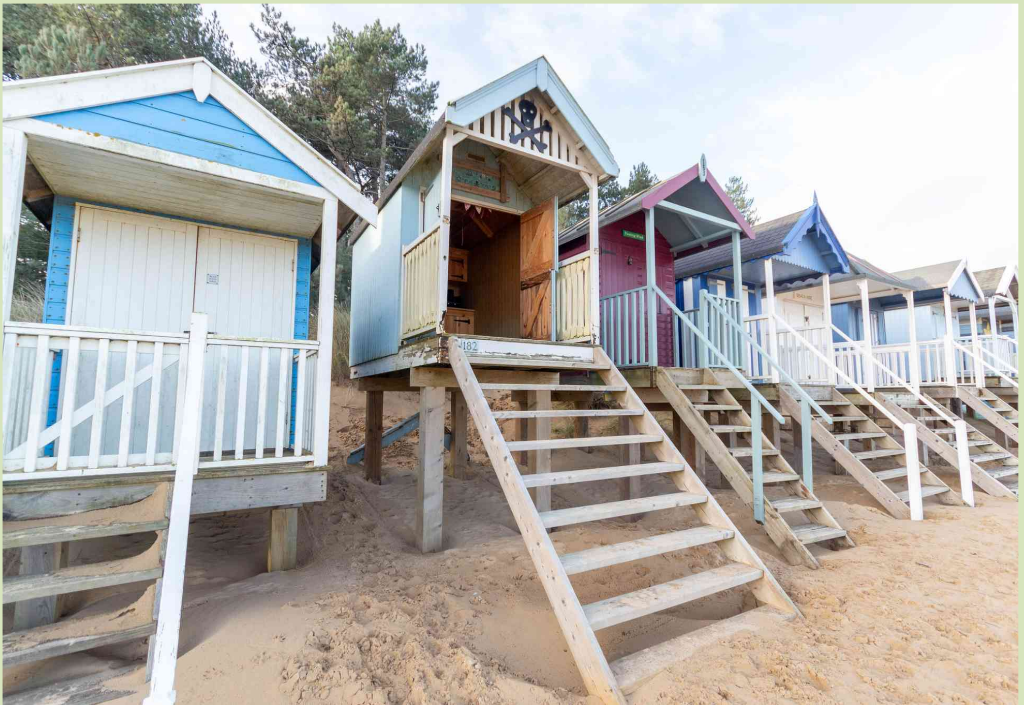
Beach Hut 183, Wells-next-the-Sea Guide Price £90,000