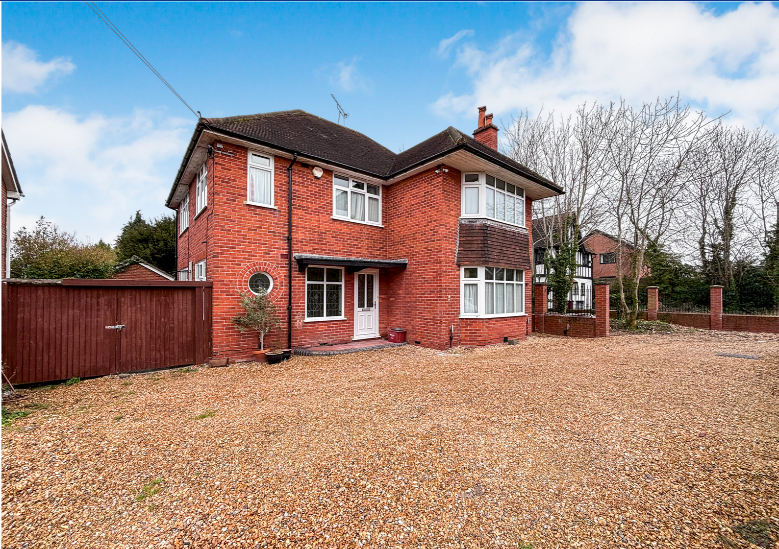
Southcote Lane, Reading, Berkshire.