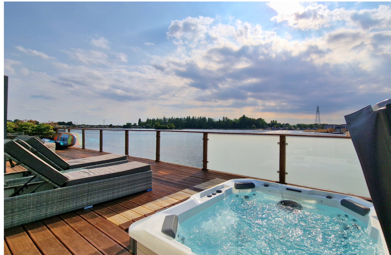
14 South Point, TALLINGTON LAKES, Stamford PE9 4RJ