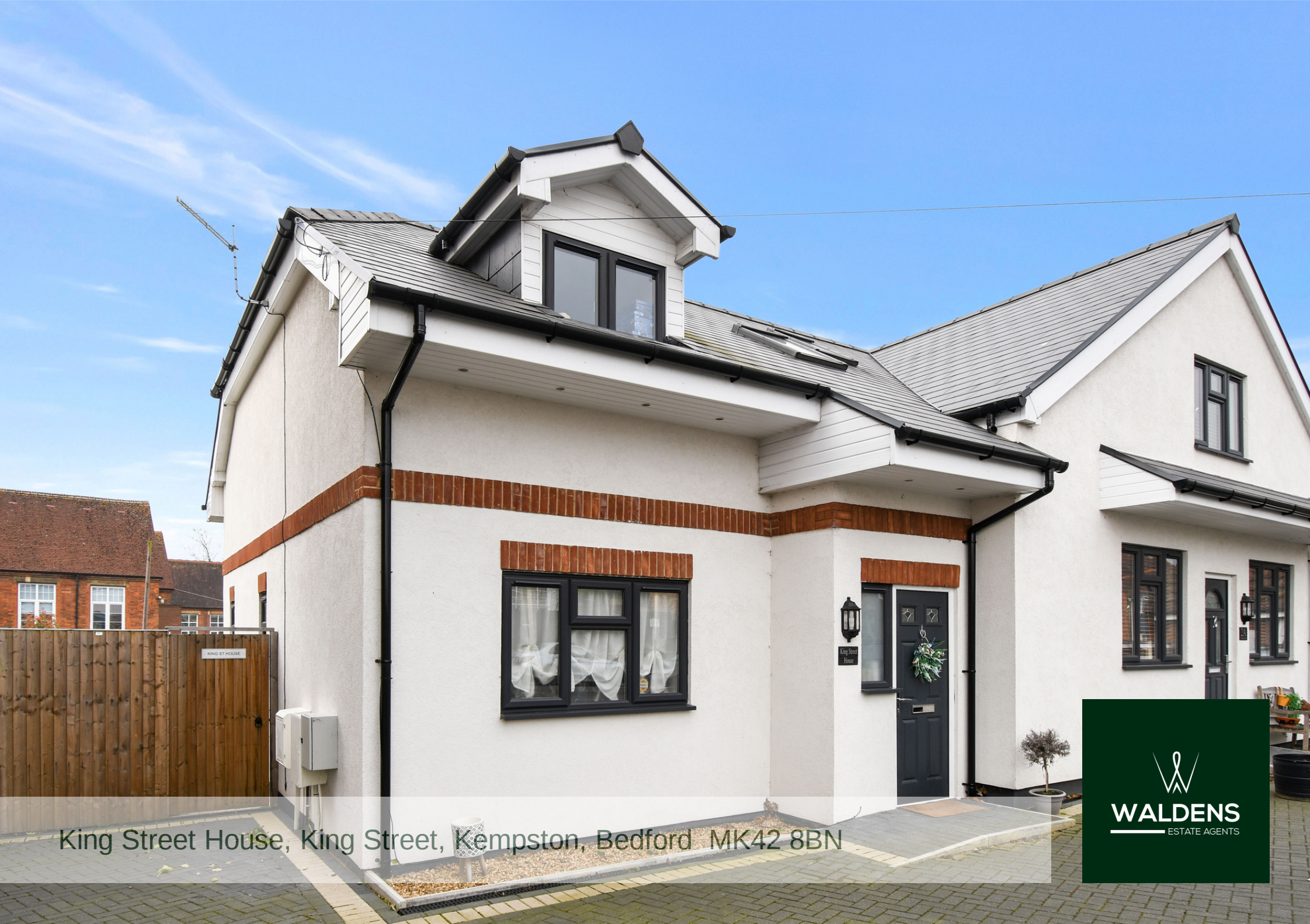
King Street House, King Street, Kempston, Bedford MK42 8BN