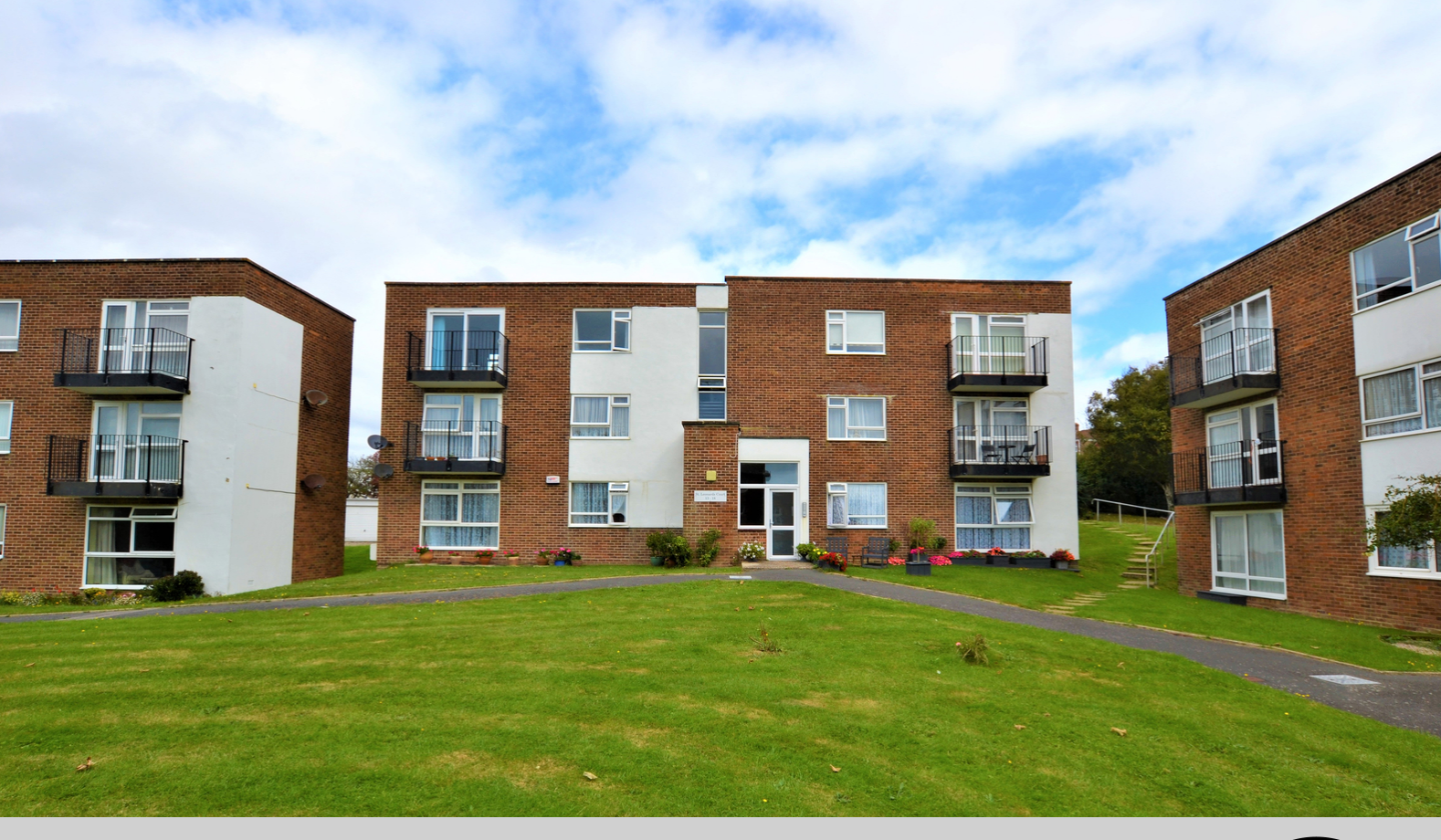
Flat 17 St Leonards Court, West Hill Road, St Leonards-on-Sea, East Sussex, TN38 OPS