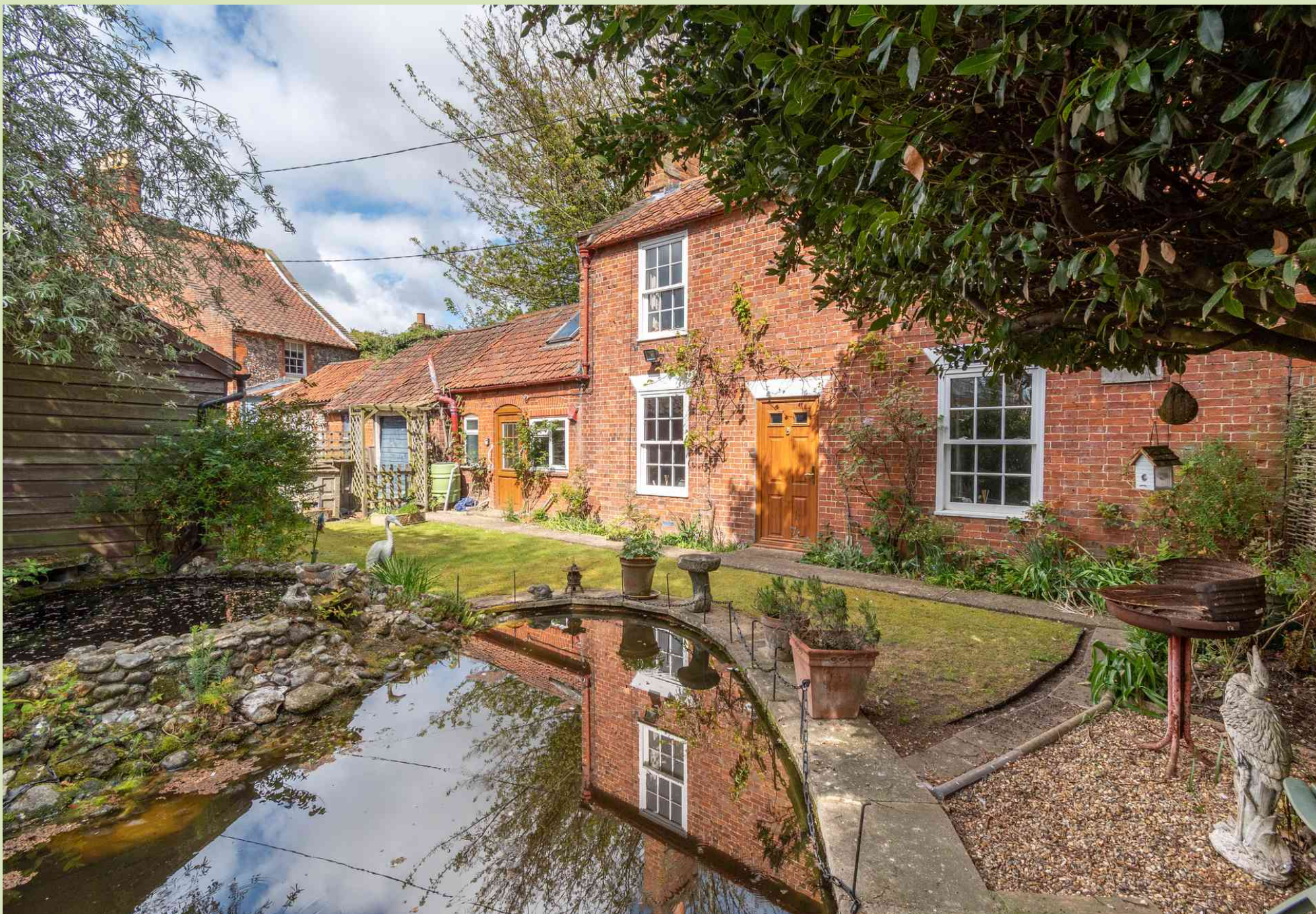
28 Knight Street, Little Walsingham Guide Price £350,000