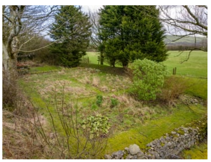
To the side of the outbuilding is a large vegetable patch with raised beds.

12' 6" x 9' 9" (3.81m x 2.97m) currently used as a coal house with side window and door to front.