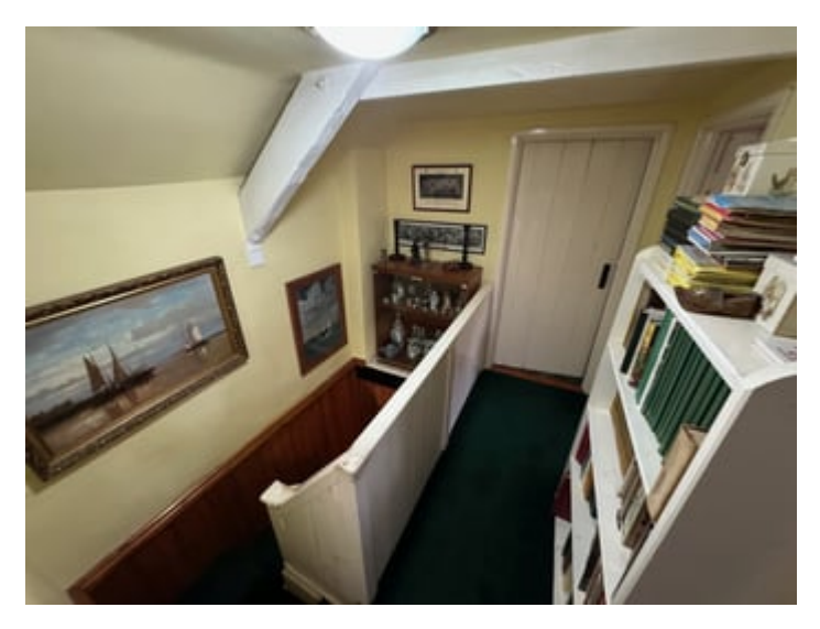
Front Bedroom 1

via original staircase with exposed beams to ceiling.