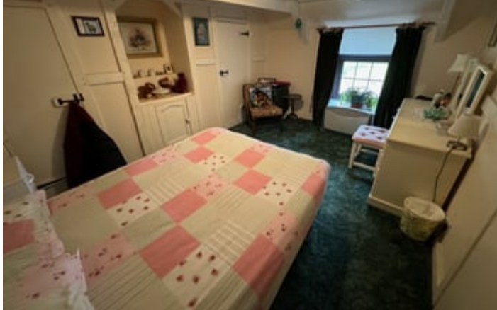
Front Bedroom 2