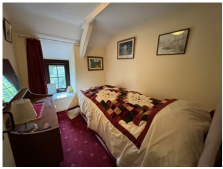
7' 9" x 6' 4" (2.36m x 1.93m) single bedroom, window to front, exposed beams to ceiling.