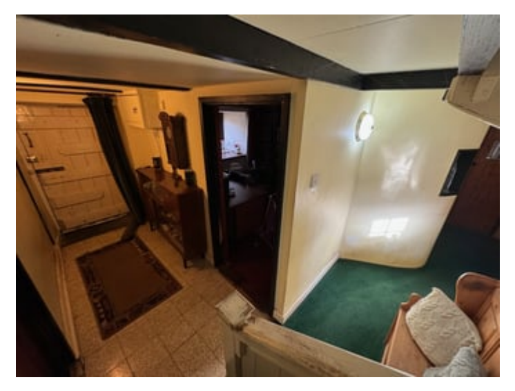
Study/Sitting Room/Potential Bedroom

Being 'L' shaped accessed via custom made hardwood door, tiled flooring, stairs to first floor, understairs cupboard.