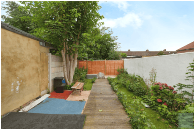
Unmeasured at the time of our inspection and thought to be in the region of 30ft. Decked area, flower and shrub borders.