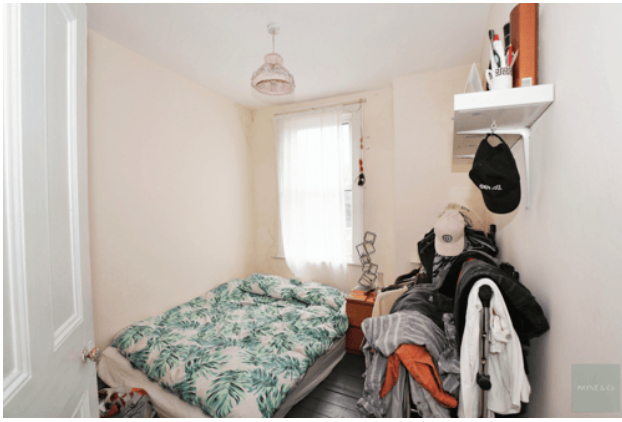
9' x 10' 11" (2.74m x 3.33m) Double glazed window to rear.