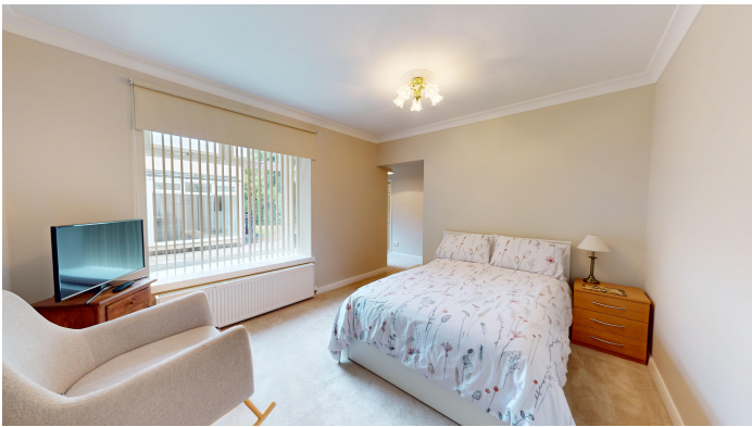
Bedroom with Dressing Room and En Suite