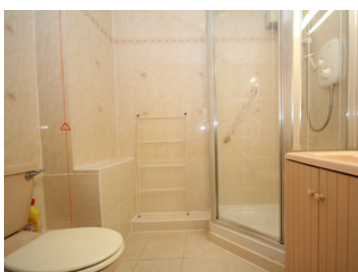
FLAT 31, THE CHINES, 43 ALUM CHINE ROAD, WESTBOURNE BH4 8DN £90,000