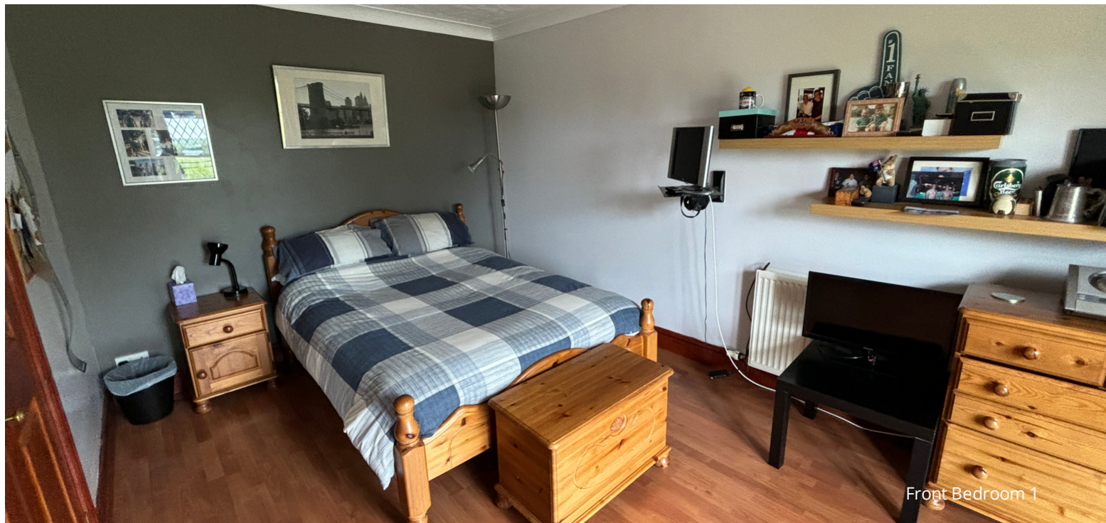
Front Bedroom 1