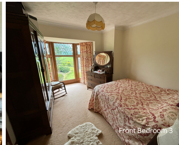
Front Bedroom 3