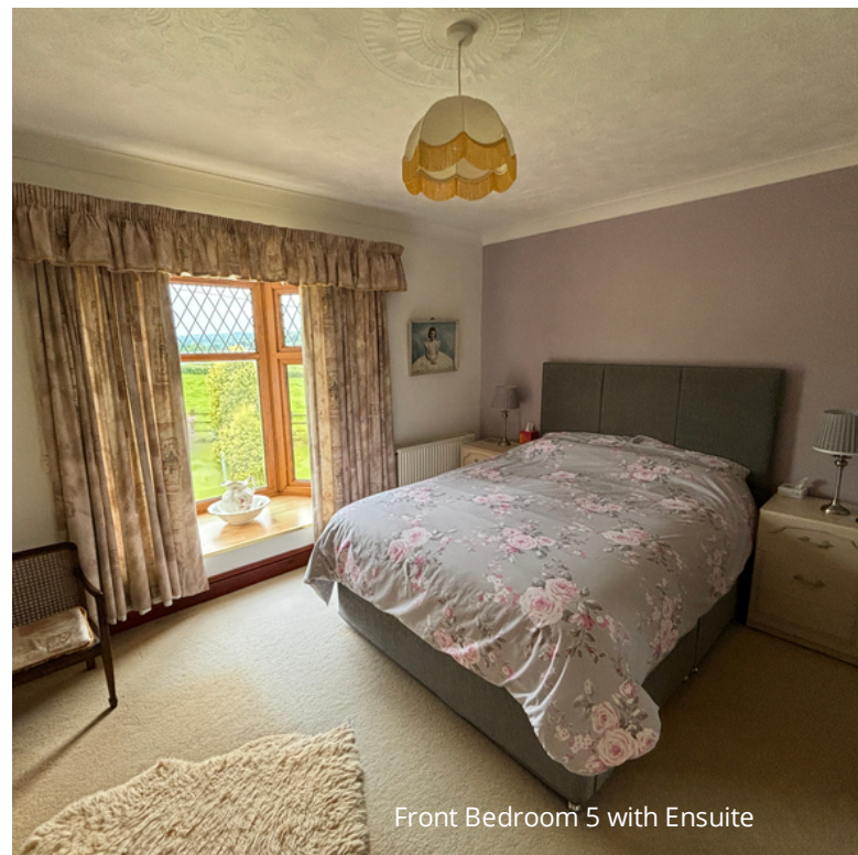
Front Bedroom 5 with Ensuite