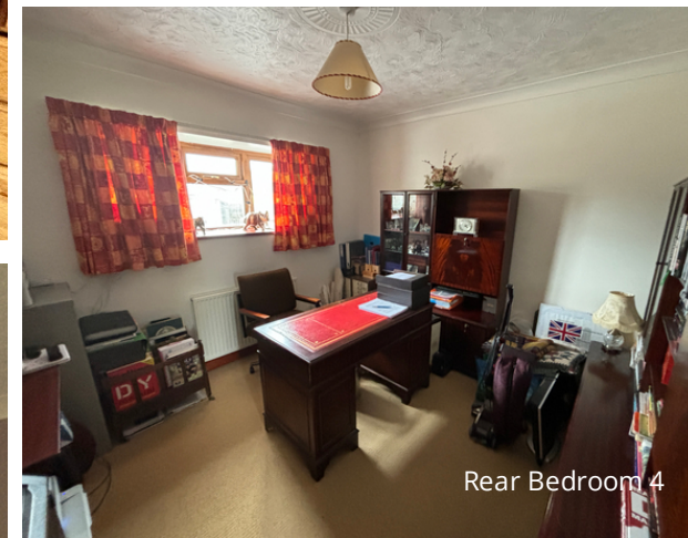
Rear Bedroom 4