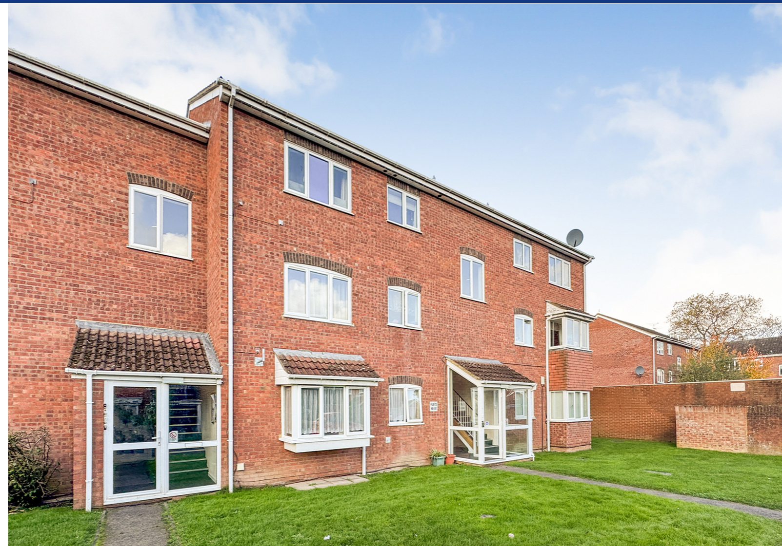
Bexley Court, Reading, Berkshire.

TOTAL FLOOR AREA : 576 sq.ft. (53.5 sq.m.) approx. Whilst every attempt has been made to ensure the accuracy of the floorplan contained here, measurements of doors, windows, rooms and any other items are approximate and no responsibility is taken for any error, omission or mis-statement. This plan is for illustrative purposes only and should be used as such by any prospective purchaser. The services, systems and appliances shown have not been tested and no guarantee as to their operability or efficiency can be given. Made with Metropix ©2021