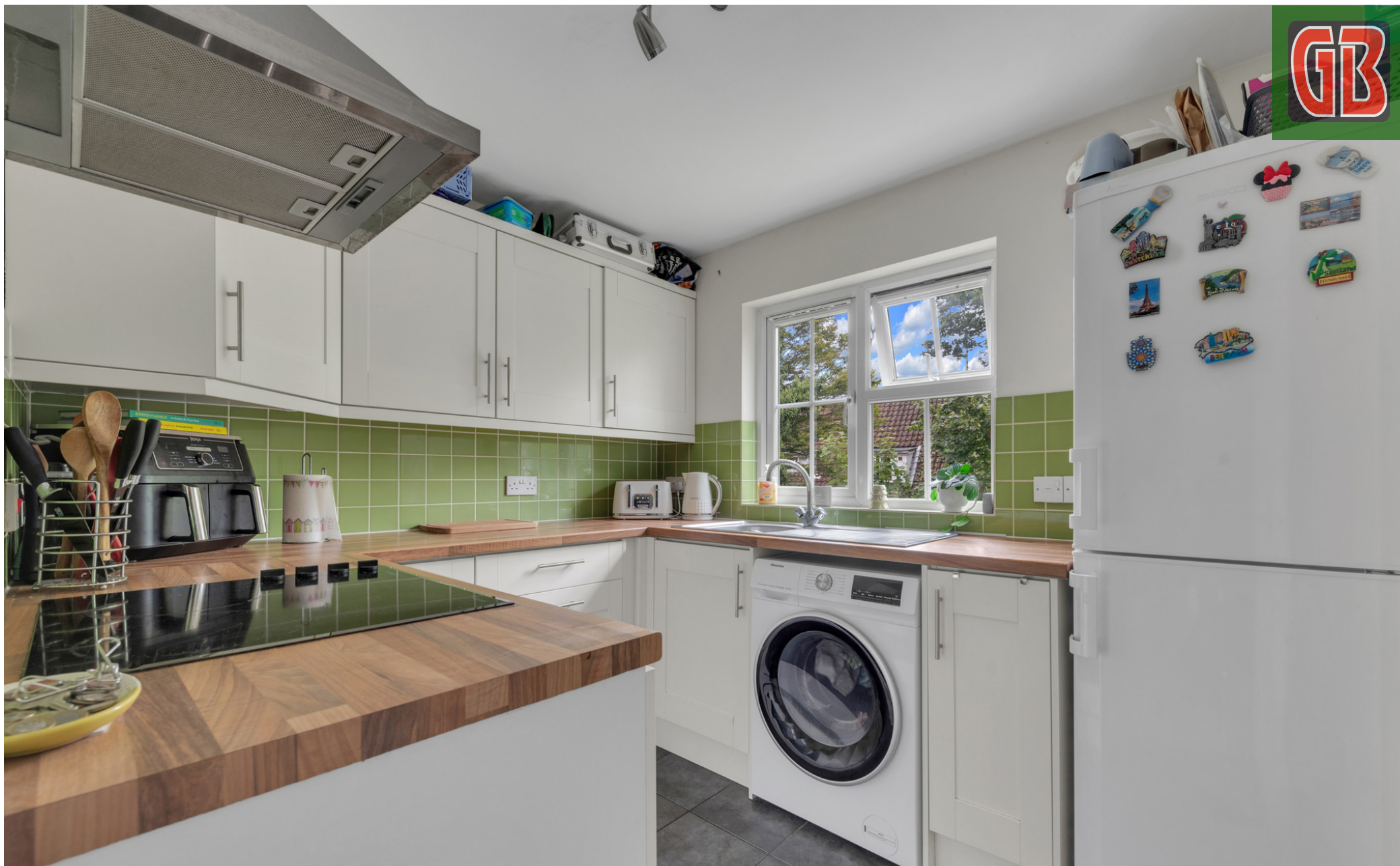
24 Pinewood Mews, Oaks Road, Staines-upon-Thames, Surrey. TW19 7NJ. 1 Bedroom Apartment - £210,000 Leasehold