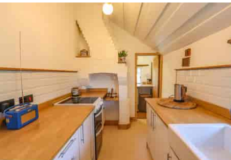
I Compass Cottages Compass Lane, Ninfield, East Sussex TN33 9NG