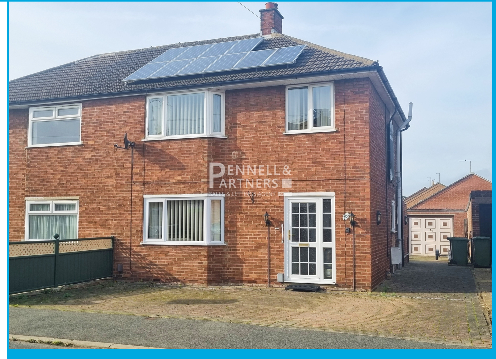
37 PLOUGH ROAD, WHITTLESEY, PETERBOROUGH, CAMBRIDGESHIRE. PE7 1LT