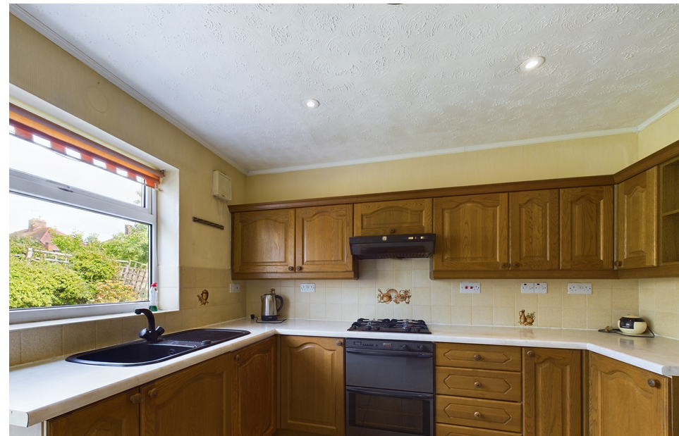
Appleton Drive, Belper, Derbyshire DE56 1FQ £300,000 - Freehold