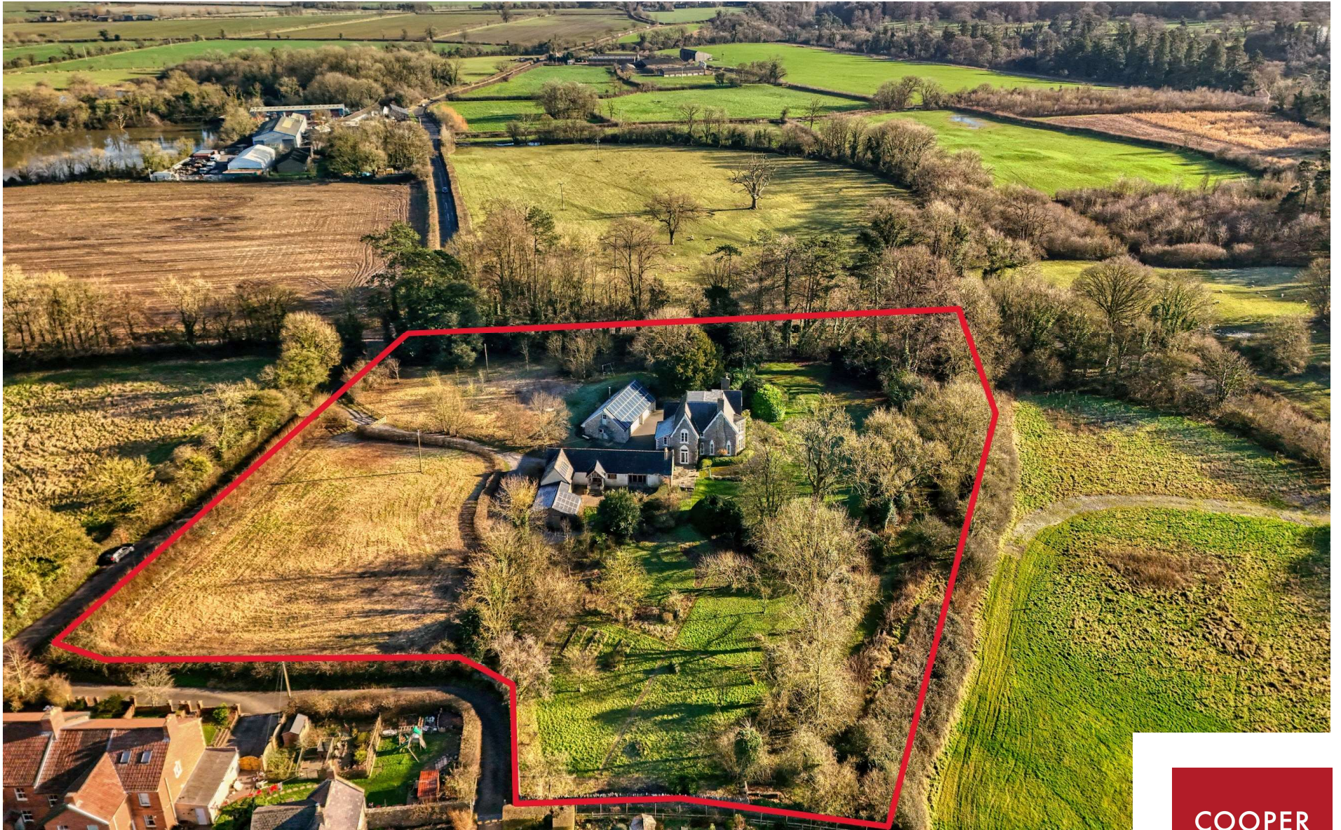
St Edmund's House, Upper Vobster, BA3 5SA