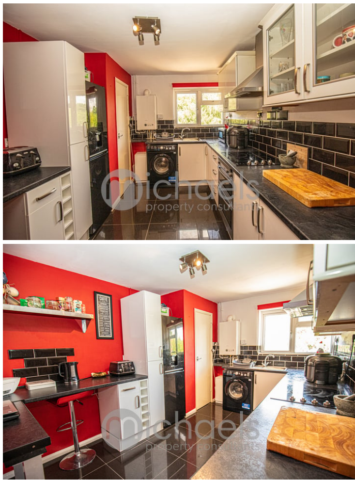
4.09m x 2.71m (13' 5" x 8' 11")