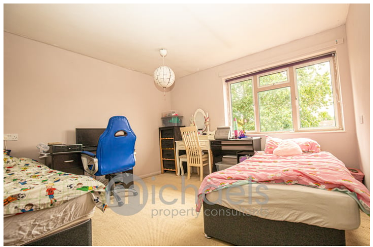
3.47m x 3.73m (11' 5" x 12' 3")