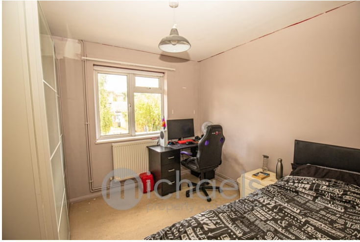
2.83m x 2.79m (9' 3" x 9' 2")