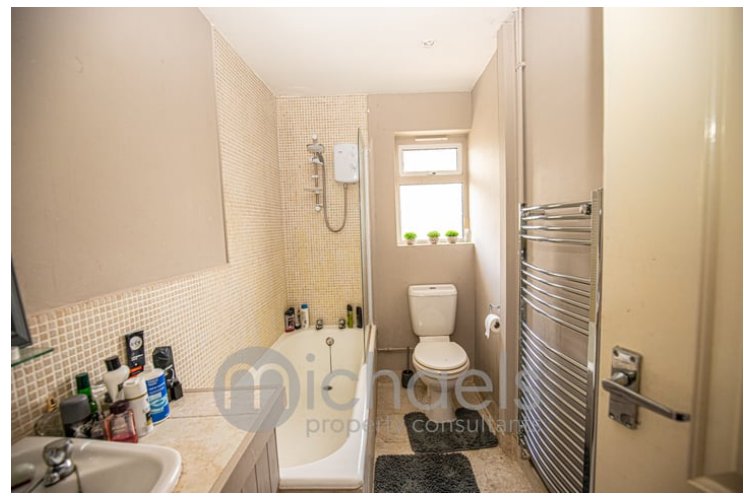
2.82m x 1.5m (9' 3" x 4' 11")